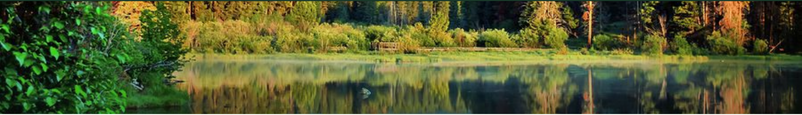
Bear Lake — one of RMNP's most iconic views. Arrive before 8am to beat the crowds.