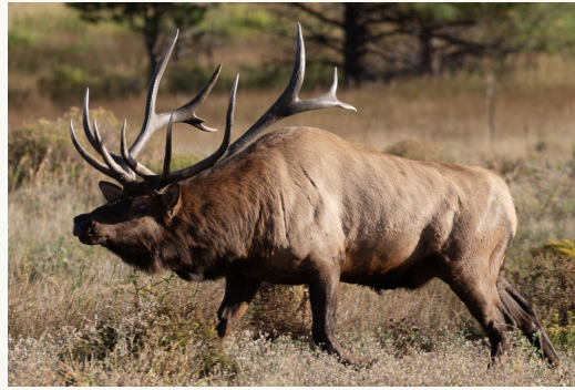
Bull elk during the September rut — one of North America's great wildlife spectacles