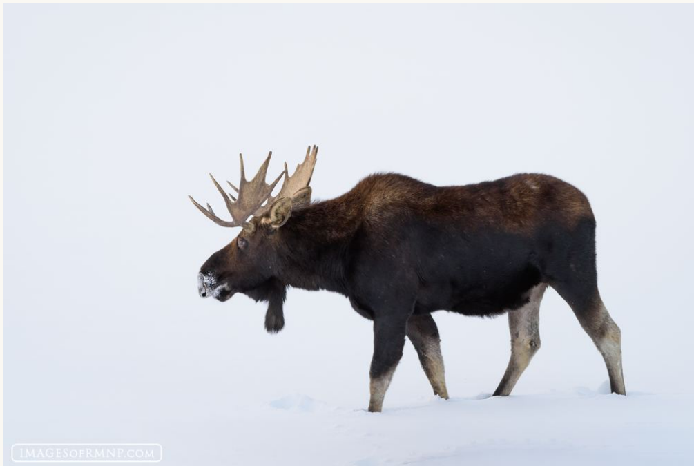
Bull moose in the Kawuneeche Valley — west side of the park, where moose are most reliably spotted